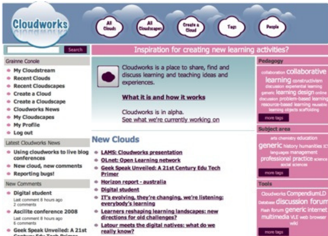
Figure 3: Revised Cloudworks site in December 2008

As a result of analysis of the feedback, the site was extensively revised, focusing in particular on beginning to build in more social functionality and working towards identifying patterns of community engagement. Figure 3 provides a snapshot of the revised site, which went live at the beginning of December 09. Four main design decisions shaped this phase, which are described in more detail below.