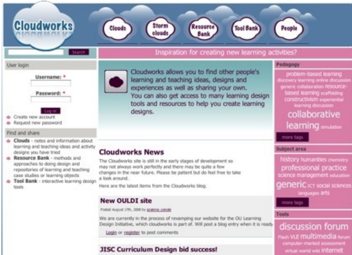
Figure 1: Initial prototype of Cloudworks

Initially the site was developed using the standard Drupal interface. In June 2008 we employed a graphics designer to give the site a more appropriate look and feel to match the vision for the site (Figure 1).