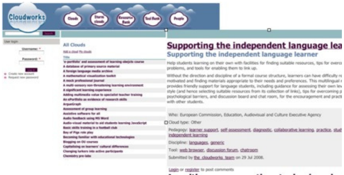
Figure 2: List of Clouds and an example of a Cloud on independent language learning

The five Cloud-types were intended to be useful both in navigating the site and also as a means of reinforcing the type of content we envisaged being included. This dual purpose of 'ease of navigation' through category types and 'reflection of intent' was similar to our decision to have three categories of tags.